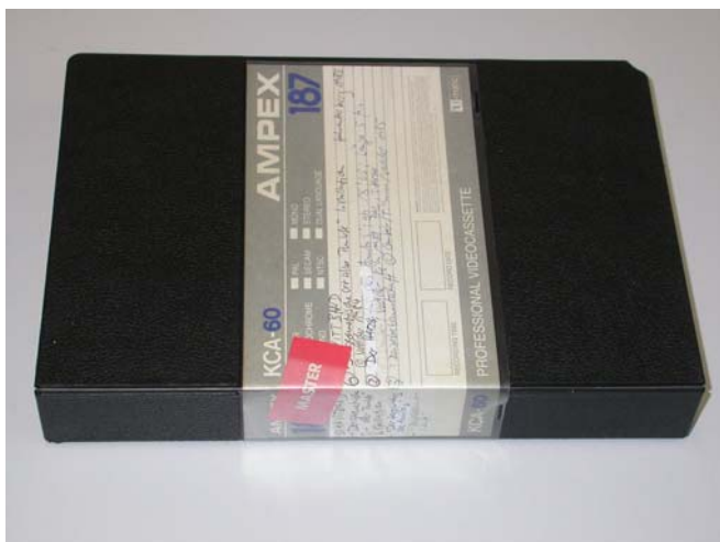
Cover of Tape 23/3-M, U-Matic LB, Ampex 187 KCA-60