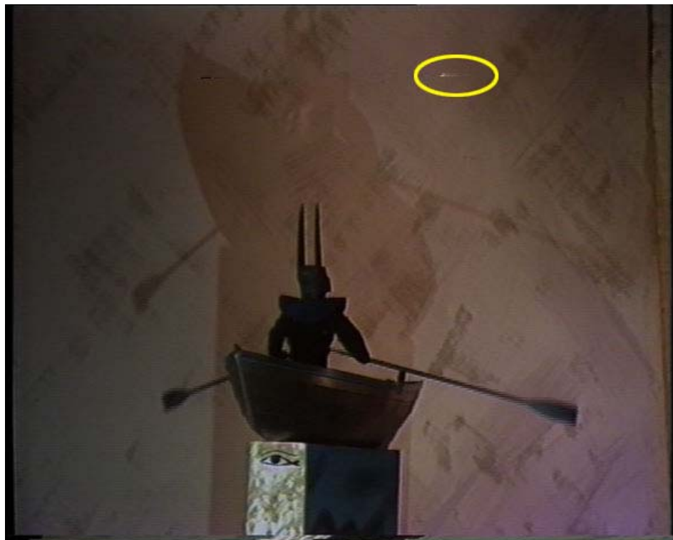
Image 1 - Small white drop-out